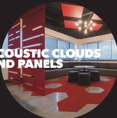
ACOUSTIC CLOUDS AND PANELS